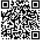
Presentation QR Code

The Beautillion Ball Presentation Form will be used during the Beautillion Ball. This is an opportunity to highlight the Beaux accomplishments and prominent accolades. The data form is located at the following link: