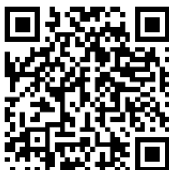
Presentation QR Code

Name of Belle (escort): _____ Last First Middle